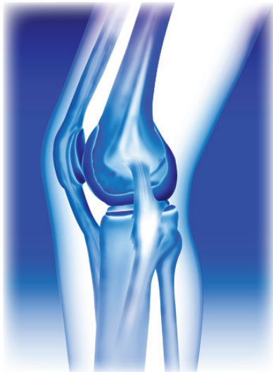
X-Ray of Human Knee

Healthy kidneys get rid of excess phosphorus in the urine. In kidney disease, phosphorus builds up in the blood causing itching, muscle aches and pains, bones that break easily, calcification (calcium deposits) of the heart, skin, joints, and blood vessels. In order to avoid these problems, it is important to limit phosphorus consumption and take the phosphorus binders with meals and snacks.